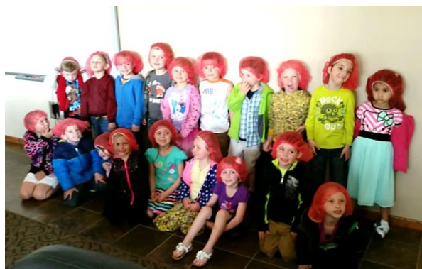
Donning hair nets to tour the factory.